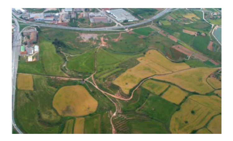
Figure: The Agulla Park